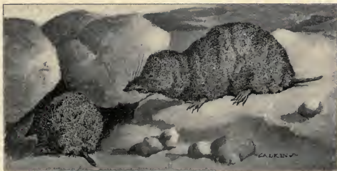
FIG. LXIII. BLARINA PERGRACILIS. OCOTLAN SLENDER SHREW.